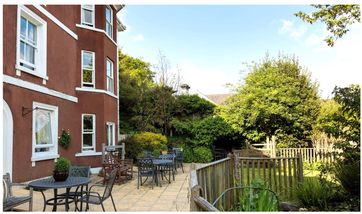
A vibrant place to be, with a range of activities

Your family members are given plenty of opportunities to take part your care and are always welcome. They of course are always welcome to drop by whenever, receive regular updates with staff and management and even attend private appointments with our staff regarding your care. Either a phone in your room or access to the home's phone is available and we can organise video calls and regular get-togethers too. Our aim is to make sure you never feel out of touch.